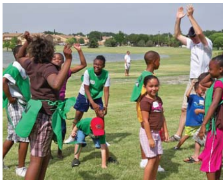
Celebration after the egg relay!

The culmination of the day's activities was a picnic lunch featuring hot dogs provided by Weinerschnitzel. Every child that attended the day's activities was given a goodie sack complete with an age appropriate book.