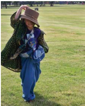
Holding on during the over-sized clothes relay

On June 17th, the members of the Loaned Executive Division participated in a half day service day focusing on giving back to the United Way Community Partners.