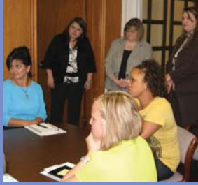
Program Review volunteers learn about Legal Aid Society

Fifty-nine volunteers served on five teams during the program review of 9 of the 22 United Way agencies. After orientations for new volunteers, teams began agency site visits in April. Each team member studied agency packets, attended a team meeting, and held question and answer sessions with agency board members and executive directors.