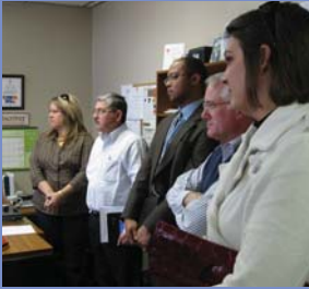
Volunteers listen to a presentation at the Red Cross

The process concluded May 28 th when the teams' co-leaders met with the leadership of the Investment/Accountability and Community Impact divisions to present their evaluations and findings.