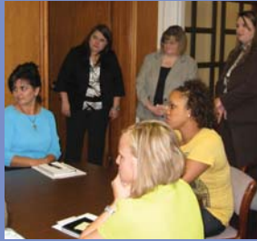
Program Review volunteers learn about Legal Aid Society

Fifty-nine volunteers served on five teams during the program review of 9 of the 22 United Way agencies. After orientations for new volunteers, teams began agency site visits in April. Each team member studied agency packets, attended a team meeting, and held question and answer sessions with agency board members and executive directors.