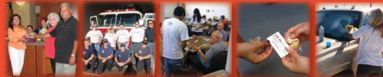
Scenes of Random Acts of Kindness

On June 23 rd LIVE UNITED- Pass it On sparked a movement across our community creating a ripple effect of random acts of kindness.